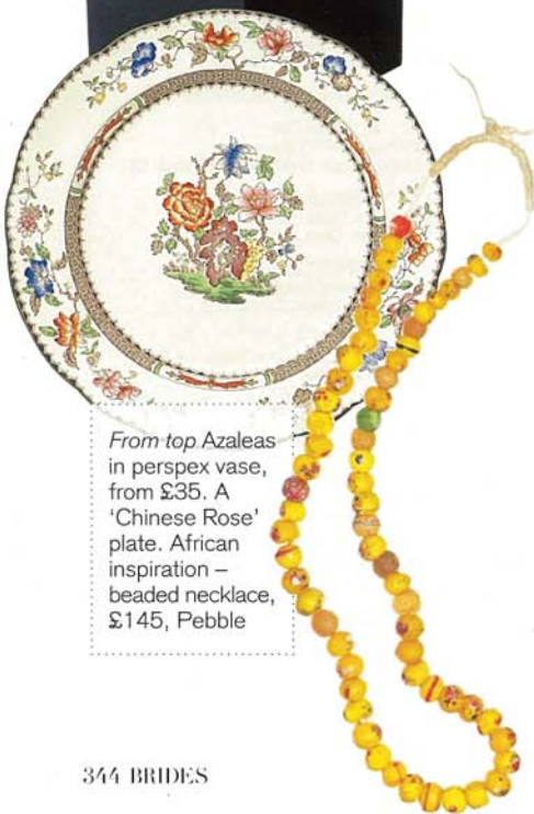
From top Azaleas in perspex vase, from £35. A 'Chinese Rose' plate. African inspiration – beaded necklace, £145, Pebble